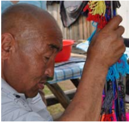
Bair Rinchinov.