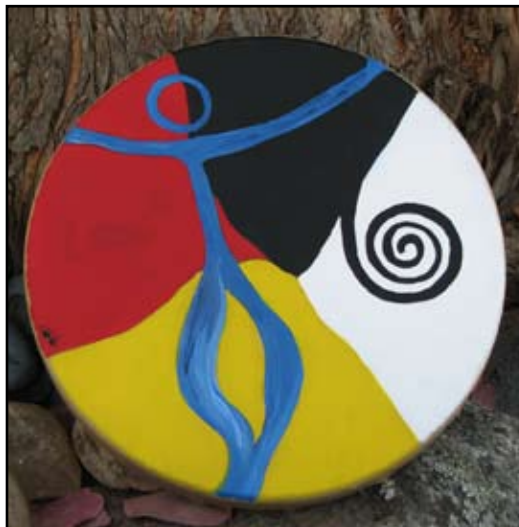
“Pathways to Balance” by Vicki L. Dobbs.

Those who have been involved in shamanic healing or divination for any length of time, either as practitioners or as recipients, know that it is powerful. Miracles of healing can and do occur. Difficult questions are answered in surprising and useful ways; problems that seem nearly impossible to resolve suddenly shift and elegant solutions appear. This